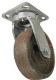
Stainless steel swivel with brimstone wheel for high temp applications.