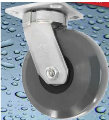
Stainless Steel Swivel Caster with Ergolastomer solid poly wheel.