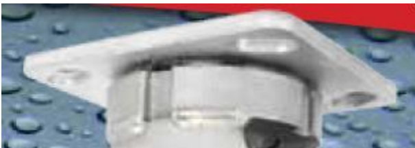
Stainless Steel Kingpinless heavy duty swivel raceway

Heavy-Duty Stainless Steel Kingpinless Casters and Wheels are for wet, damp, or harsh environment applications including: food processing plants, slaughter houses, fish hatcheries, pharmaceutical laboratories. Capacity 400 - 2,000 pounds. 4" x 4.5" top plate; 2" tread width wheels. Stainless steel roller, precision, & plain bore bearings available. Large selection of wheels & bearings for a range of applications.