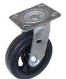
5" X 2" Swivel Caster rubber on cast iron wheel