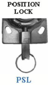
Welded on 4 Position Swivel Lock adds $8.00 per swivel caster.