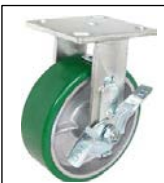
8" X 2" Rigid Caster poly on cast iron wheel w/ top lk brake