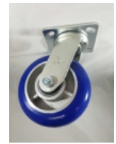
8" X 2" Swivel Caster with round tread poly wheel