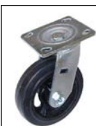
8" X 2" Swivel Caster rubber on cast iron wheel