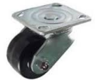
3.25" X 2" Low Profile Swivel Caster with phenolic wheel