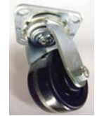
8" X 2" Swivel Caster phenolic wheel.