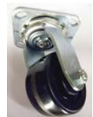
4" X 2" Swivel Caster phenolic wheel.